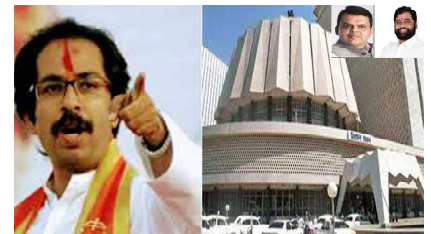
The BJP-Shinde faction wins the Floor-test. Inset: Clockwise: Shiv Sena Chief Uddhav Thackeray, DCM Devendra Fadnavis, and CM Eknath Shinde.

During the floor test, 10 to 12 MLAs including the Congress MLAs, reached late and the Speaker Rahul Narvekar directed the staff to close the doors of the Vidhan Bhavan lobby. Eventually, the late comers could not remain present in the House during the Floor-test and the MVA strength came down further.