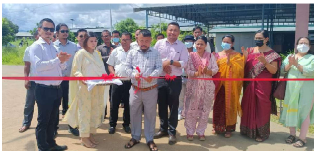
IT News Kakching, July 04:

District Administration, Kakching organized Meeyamgi Numit (People's Day) for Kakching District today at Deputy Commissioner