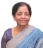
By: Nirmala Sitharaman