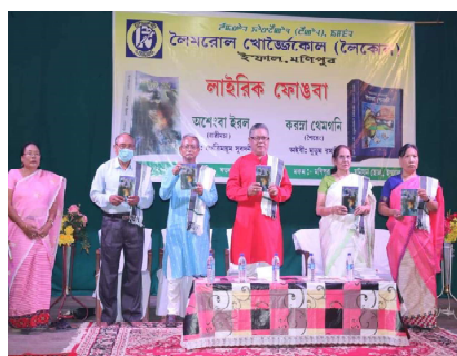
IT News Imphal, July 04: