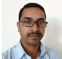
By: M.R. Lahu

The need of the hour is to make the 'Vision -2047' public and make sure that people of the state knows what the government is expecting Manipur after 25 years.